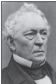
Edward Everett