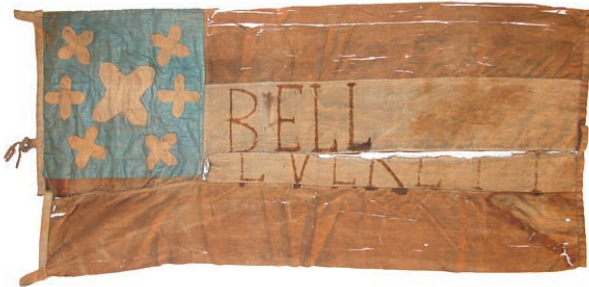
Bell-Everett Flag

The Bell-Everett flag is a most interesting but rather mysterious one. This is a captured battle flag but with an inscription that is political instead of military. It is a Confederate flag that was used to defend secession and disunion, but the names printed on the flag are associated with the desire for preservation of the Union. The canton includes only seven stars indicating that the flag was made very early in the war, perhaps even before the outbreak of war. Flags at that time were being made in the heat of zealous enthusiasm for the cause, yet the names of Bell and Everett had been associated only a few months before with patience and moderation. Joseph W. Rich, curator at SHSI-Iowa City in the early 1900's, speculated that "Whoever made it may have been especially sore about the 1860 election, 'Bell' and 'Everett' probably referring to candidates who had lost!" Since there is no historical record of ownership or capture of this flag, a look at the 1860 presidential election and its aftermath may help explain why a Confederate unit would display such an emblem in combat.