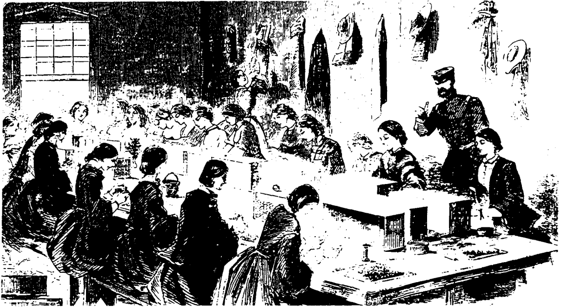
Harpers' Monthly, 1861

This 1861 illustration shows how many women contributed to the Civil War effort by making bullets.